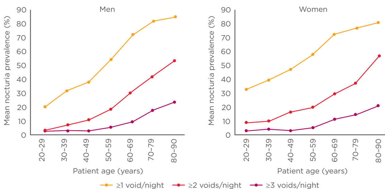
Figure 1: Nocturia is common across all age groups in both men and women.

The burden of nocturia increases with frequency of voids. A study showed deterioration of health-related quality of life was associated with an increasing number of night-time voids ( p<0.001 ) with significant differences observed between 0-1 voids and >2 voids ( p<0.001 ). 7 A meta-analysis of seven studies (N=28,220 patients) showed nocturia was associated with increased all-cause mortality (hazard ratio [HR]: 1.23 for all patients with nocturia; HR: 1.46 for patients with >3 voids). 8